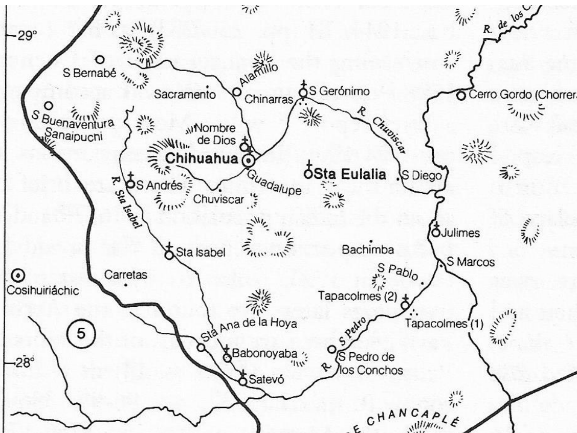
Map of Julimes and its proximity to the Villa de Chihuahua, Nueva Vizcaya (The North Frontier of New Spain, Peter Gerhard, page 196)

This census is a household-by-household type in tabular format. Portions of the original census are badly damaged. The households are unnumbered, the persons are grouped by categories of marital status, of age 14 and above, under the age of 14, widowers, widows, unmarried (male and female) and slaves. Only the head of the household is named; the spouses and children are not named but they are enumerated. The racial classification of the persons are also recorded: Españoles, Mestisos and Yndios. There are no occupations recorded and no record of where the residents originated from, i.e. were they natives of the area, elsewhere in Nueva Vizcaya, or beyond Nueva Vizcaya.